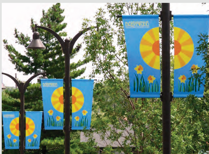
Seasonal City Banners

WindSAVER AND BannerMASTER BRACKETS INCLUDE ALL MATERIALS TO HANG ONE POLE BANNER. DOUBLE POLE OPTIONS AVAILABLE.